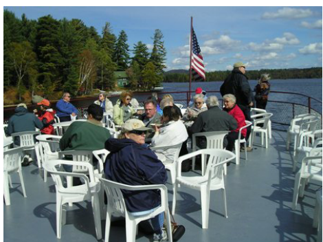
SOAR members on the W. W. Durant in 2006