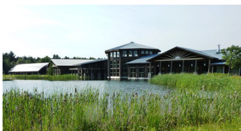
View of The Wild Center

9:00am Bus pick-up at the Price Chopper parking lot in Canton (at the stop light, just off the corner of the intersection of Highways 310, 11, 68)