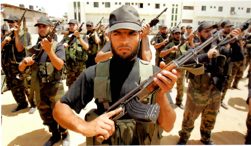
Hamas militia members take position after they evacuated Gaza streets in May 2006. The Hamas-led Palestinian government ordered its militia off Gaza's streets in the wake of clashes with President Mahmoud Abbas's rival Fatah movement that stirred fears of civil war.

ment between Israel and the Palestinians. Once again, the U.S. had come to the realization that peace between Israel and its neighbors was a necessity for securing U.S. interests in the region, and that by ignoring the urgency of the issue, the conflict had only been exacerbated.