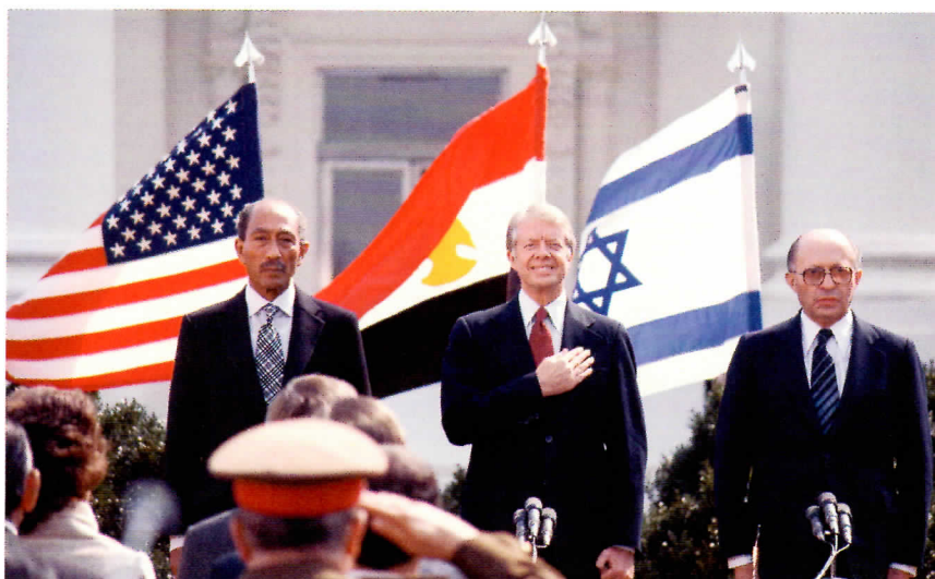
President Jimmy Carter, Egyptian President Anwar Sadat (left) and Israeli Prime Minister Menachem Begin (right) stand during the playing of national anthems on the north lawn of the White House during ceremonies for the Camp David Peace Accords in March 1979.

Despite this alliance, divergent interests emerged in the 1980s, beginning with Reagan's decision to sell AWACS and F-15 aircraft to Saudi Arabia. The limits of the Israeli-American relationship emerged most visibly during Israel's 1982 war in Lebanon (the "First Lebanon War"). The invasion was initially an attempt by Israel to contain Palestinian attacks on its northern border towns, but it quickly escalated into a full-scale effort to remake Lebanon as Israel's Christian ally. Secretary Haig was informed of Israel's war plans by Israeli Defense Minister Ariel Sharon in the spring of 1982. Israel's unprecedented siege of Beirut that summer disturbed Reagan deeply and led to a confrontation with Prime Minister Begin. After Reagan and his advisers realized that Israel's actions posed serious challenges to their broader Middle East strategy, the president remarked to Begin that "Your actions in Lebanon have seriously undermined our relationship with those Arab