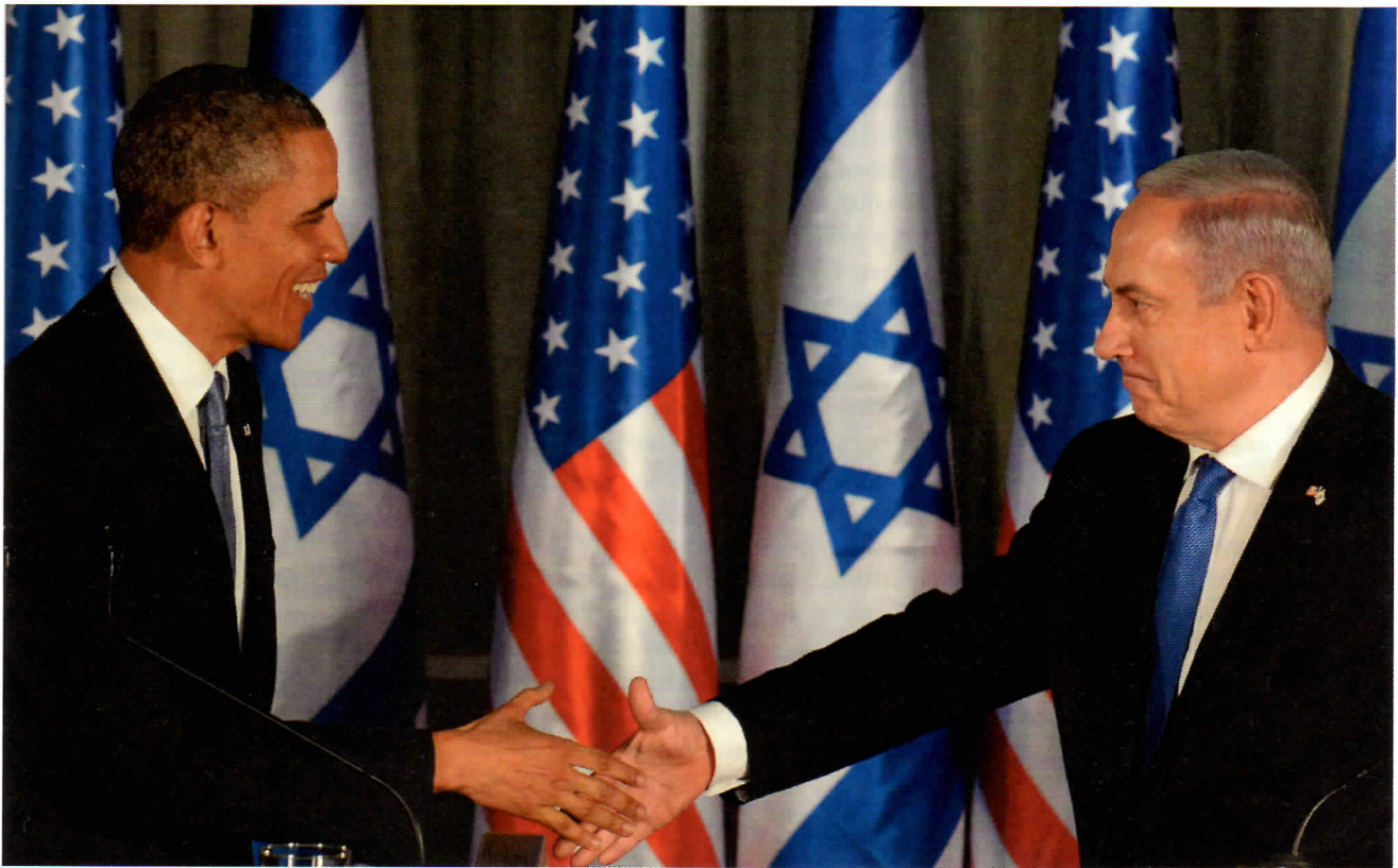
U.S. President Barack Obama shakes hands with Israel's Prime Minister Benjamin Netanyahu during their press conference in Jerusalem, part of Obama's official state visit to Israel and the Palestinian Territories in March 2013.

T he depth of emotion that surrounds public and private conversations about the relationship between Israel and the U.S. can be staggering. From college campuses to church groups, think tanks to synagogues, and op-ed pages to congressional hearings, few issues are as contentious as America's relationship with the State of Israel.