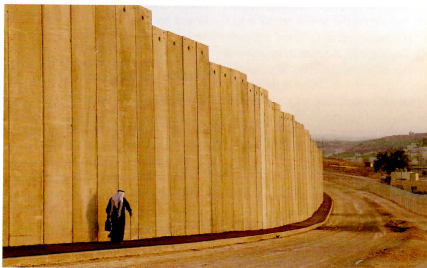
A Palestinian man walks along the Israeli-constructed barrier wall separating Jerusalem from Abu Dis, a village in the West Bank.

Secretary of State Condoleezza Rice led the Bush administration’s revival of U.S. efforts to mediate peace, and invited Israelis, Palestinians and other Arab representatives to a conference in Annapolis, MD, in November 2007. The Annapolis Conference was intended to restart the peace process and boost international support for a negotiated settle-