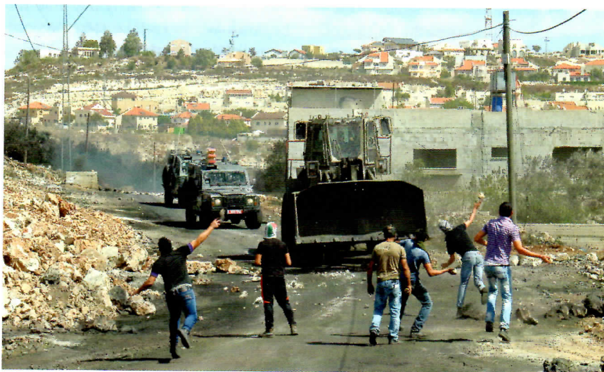
Palestinian protesters throw stones at Israeli vehicles during an October 2013 protest against the expanding of Jewish settlements in Kufr Qadoom village, near the West Bank city of Nablus.

In September 2010, Obama hosted Netanyahu, Abbas, Jordan’s King Abdullah and Special Envoy Mitchell for the restart of negotiations to reach a final status settlement. As Israel’s settlement moratorium lapsed, the talks broke down, and Mitchell eventually resigned from the office of the Special Envoy in May 2011.