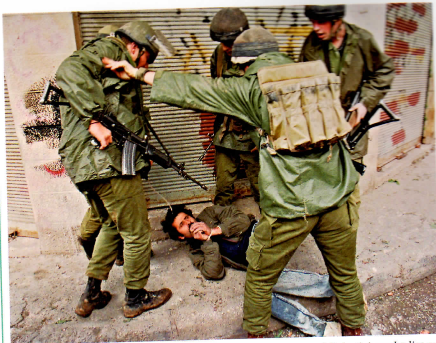
An Israeli soldier restrains another from manhandling an arrested Palestinian who lies on a Nablus street with his hands tied together, during anti-Israeli demonstrations in the first intifada in February 1988.

manner that has affected both countries well into the 21st century.