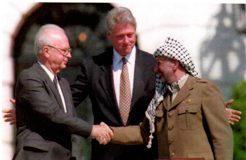
U.S. President Bill Clinton watches as PLO leader Yasser Arafat shakes hands with Israeli Prime Minister Yitzhak Rabin, September 13, 1993. Rabin and Arafat shook hands for the first time after Israel and the PLO signed a historic agreement on Palestinian self-government in the occupied territories.

But the peace process launched by the Oslo Accords was nowhere near as picture perfect as the famous handshake suggested. In September 1995, Arafat and Rabin signed the Interim Agreement on the West Bank and Gaza Strip, or Oslo II, establishing the Palestinian Authority (PA) and dividing the West Bank into three separate zones of control. There was enormous skepticism of Arafat's move in the Arab world, where he was seen as selling out meaningful Palestinian sovereignty for the sake of his own return to the West Bank, where he was to be appointed as president of the PA. Oslo II granted the PA limited self-government, for an interim period of time, providing the vestiges of statehood without actual content. The process around Oslo lulled its proponents into the false belief that real issues like Jerusalem, refugees' right of return, settlements and security were being dealt with. Oslo II became the basis of the Wye River Memorandum in 1998 and President George W. Bush's Roadmap for Peace in 2002.