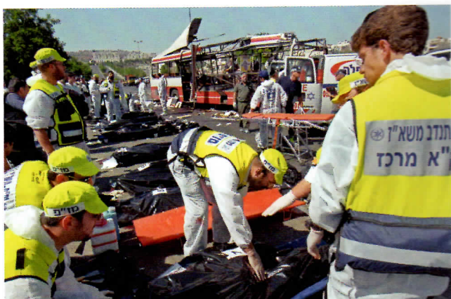
Rescue crews remove body bags from the site of a Palestinian suicide bomb attack on a Jerusalem bus in June 2002.