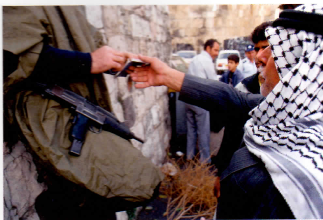
A Palestinian hands his I.D. to an Israeli soldier at a Jerusalem checkpoint in 1991.

in January 2001, by which point the Al-Aqsa Intifada , or the second Intifada , had erupted.